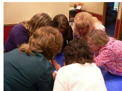
A group of women like this one are growing closer as they journey through the 10 Smart Things study.

10 Smart Things continues to get the word out there—studies show books are read an average of seven times.