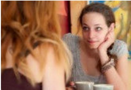
God places people in our paths..

Two weekends ago I was in Saskatoon for some meetings with a major women's conference ministry leader. We sat in the coffee shop of the Holiday Inn discussing the Spring conference and making plans. A cute little Filipina served us breakfast and late, soft drinks. We chatted a bit with the friendly young girl as we sat and sat and talked and talked.