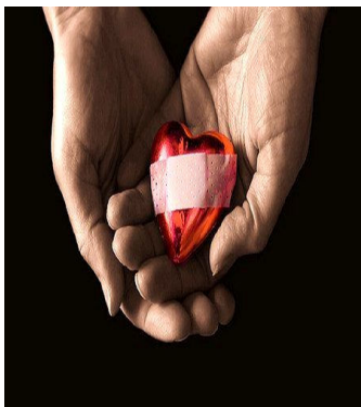
The hands that holds our broken hearts are God’s.