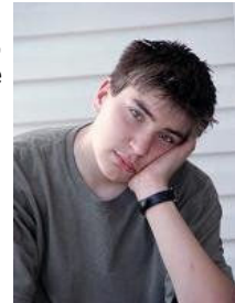
More than ever I believe students need to hear and experience the life giving truth about Jesus

"We met at Teen camp .... I just wanted to say that when you talked about the girl who killed herself, it hit me hard. I've been battling depression for a couple years now and I'm to scared to tell any one about it, even my family. I feel like she did, I feel worthless most of the time, I feel like there is no good reason for me to stay on that boat. I'm not really sure why all of a sudden I'm talking about this"