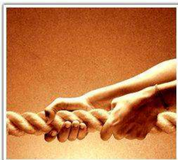
There's a tug of war in our hearts...let God win.