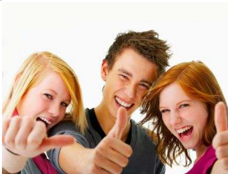
Students are some of the most open people in our country.