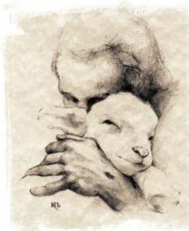
Jesus welcomes us with complete forgiveness.