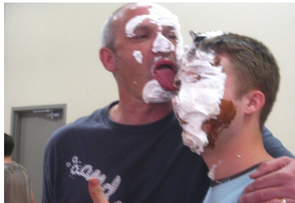
Are you really licking whipped cream off his face?

to last him well into his 10 th decade. He continues to do summer camps, not out of a deep desire for the gross and the grubby, but because