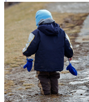
Getting unstuck isn't easy.

Although the years of stuckness were very frustrating and discouraging to me, I can see God's wisdom in it.